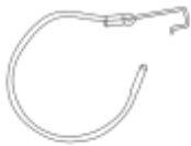
1×Single hook Lanyards